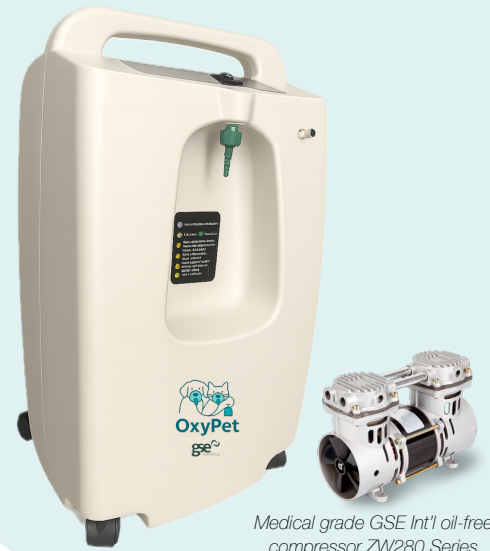
Medical grade GSE Int'l oil-free compressor ZW280 Series